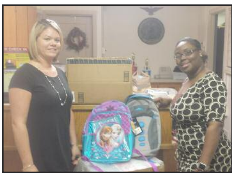
A Clyde Erwin Educator and Administrator gratefully accep school supplies.

On September 19, boxes of school supplies donated by members of First Presbyterian for the Back-to-School Drive were delivered to the school. A quick count of items resulted in these amounts: 11 backpacks, 17 bottles of hand sanitizer, 20 bottles/stick packs of glue, 6 boxes of facial tissues, 27 packages of notebook paper, 6 packs of construction paper, 2 packs of printer paper, 12 packs of colored pencils, 7 packs of sticky notes, 8 crayon packs, 29 pencil/pens packs, 6 scissors, 4 flash drives and a partridge in a pear tree!